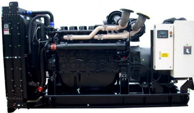
*Picture for illustrative purposes only. Model Shown Perkins 4006